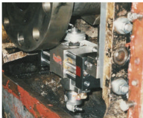
Mounting the "Millgrind" Equipment on a 400 mm \varnothing Main Journal