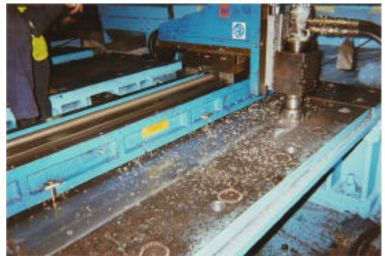
Milling of a 2.5M long pedestal base for a wheel testing machine at Dunlop