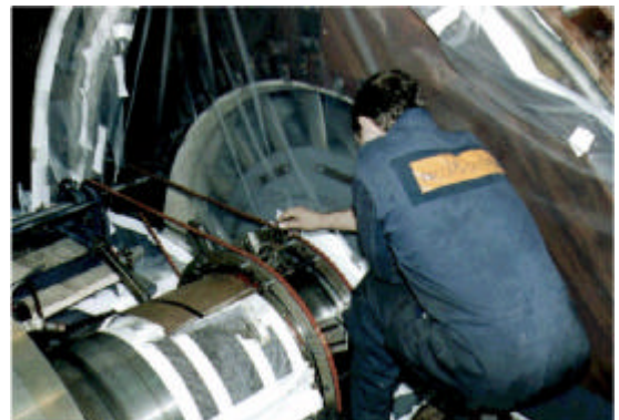
Machining and Polishing of a 610 mm Ø Hydrogen Seal Face