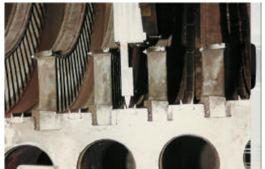
Machining To Give Correct Clearances On The Seal Strips