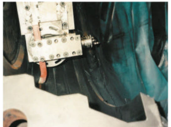
Machining A Casing To A New Profile To Increase Efficiency